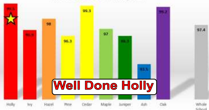
Attendance - 13-17 May 2019