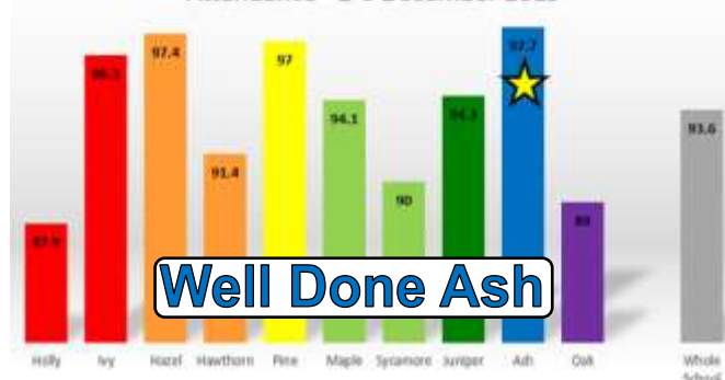
Attendance - 2-6 December 2019