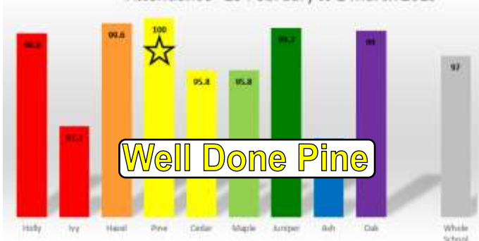
Attendance - 25 February to 1 March 2019